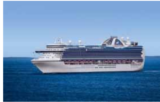
Emerald Princess Pictures

Emerald Princess is a large ship in the Princess fleet. She offers nearly 900 balcony staterooms from which to take in each vibrant horizon, or capture a breathtaking sail-in to a romantic city like Venice. Relax and enjoy the street performers in the Italian-inspired Piazza or lose yourself in a lounge at Movies Under the Stars.® The 24-hour International Café and award-winning Vines Wine Bar fulfill your cravings for fresh desserts, toasted paninis, and more. Discover cuisine and activities that bring the colors, cultures and flavors on board, and come back with new perspectives, new friends, and incredible memories.